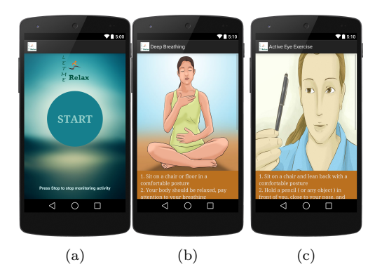
Figure 2: Let Me Relax android application states: (a) Home (b) Deep breathing, (c) Active eye exercise.

notification from phone is pushed to Let Me Relax watch app over AppMessage infrastructure. Each message is exchanged as a dictionary object that bundles a tuple; each tuple represents a command and is given a unique number. Finally, the user is notified through a haptic feedback [17, 18, 19] based on the command encoded in the dictionary.