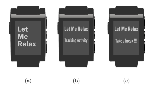
Figure 1: Let Me Relax pebble watch application states: (a) Home (b) Activity Tracking (c) Notification

watchapp SDK<sup>3</sup>; it runs on a pebble smartwatch<sup>4</sup>. The smartphone application is built on the Android platform, and it is compatible with smartphones running android version KitKat and above. User activity recognition is central to the functioning of Let Me Relax . Accelerometer data corresponding to a user's activity is streamed from smartwatch to smartphone for activity recognition. Both smartwatch and smartphone applications will be referred to as Let Me Relax for convenience. They work in conjunction to automatically identify a prolonged sedentary state, and unobtrusively notify the user to relax along with a suggestion. Thereby, the system aims at assisting users in achieving mental wellness, cognitive reappraisal, and relief from stress and anxiety.